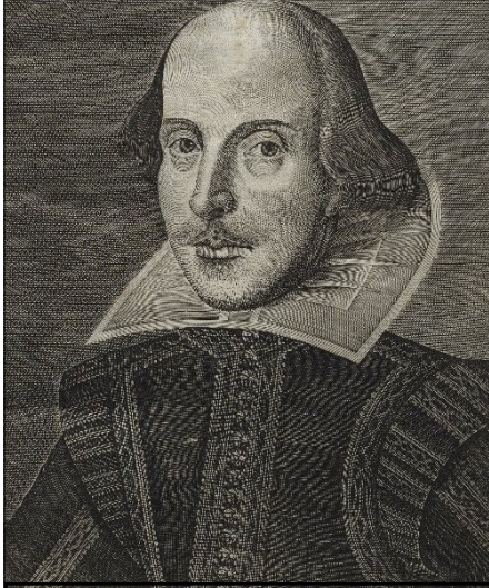
William Shakespeare by Martin Droeshout from the title page of the First Folio, Folger Shakespeare Library.