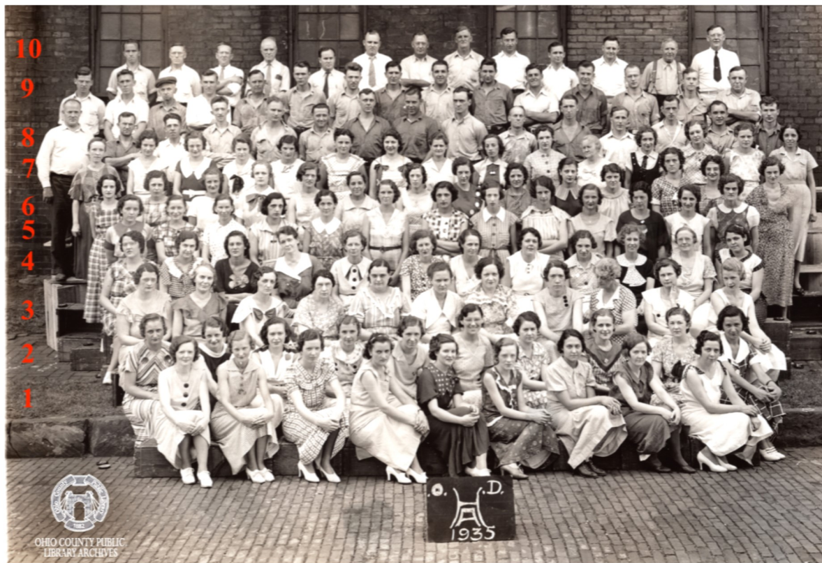
Photo 2: Hazel Atlas Glass Company Employees in front of the Wheeling Factory, 19th and Jacob St., 1935

In addition to its iconic home canning jars, Hazel Atlas was a major producer of inexpensive "Depression Glass" table sets of pink, green, blue, colorless, and black glass. From 1930 to the 1950s, Hazel Atlas was the largest glass company in the United States. The company's headquarters were located at 87 15th Street in Wheeling. Did any of your relatives work for Hazel-Atlas? Do you see them in this photograph?