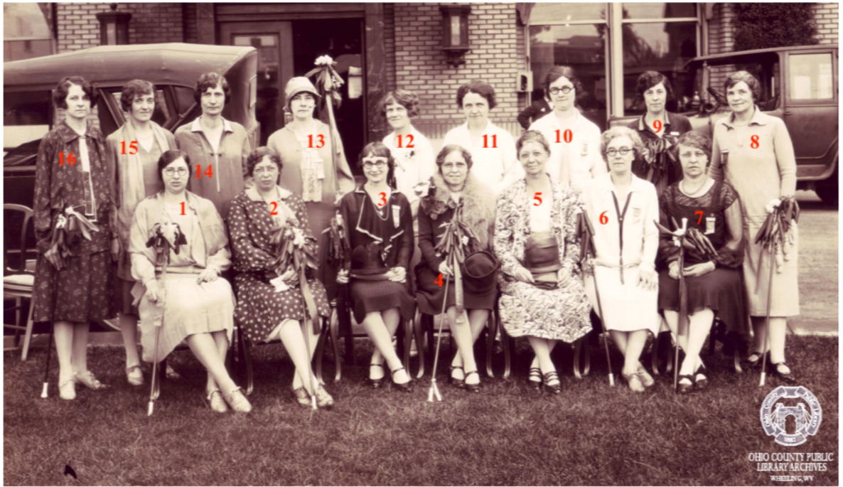
Photo 2: Wheeling Business and Professional Women's Club, 1927 National Convention